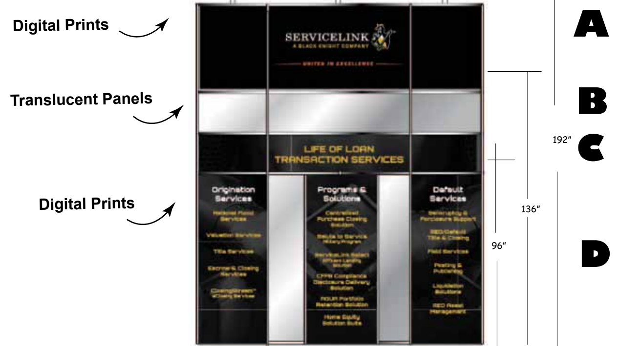
Conference Room-Side Elevation "B"

client project job # date scale BKFS MBAAnnual J14-0044 09/15/14 none